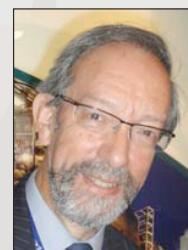
RICHARD GARDNER AVIATION